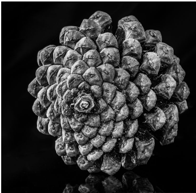
Third Place: “Pinecone” By Goutam Sen